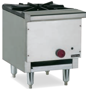
TJBSP18 (Shown with optional Jet Burner)