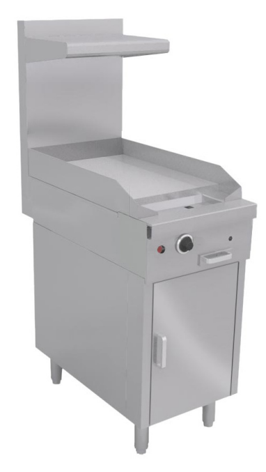
Model shown P18C-T with optional 24" flue riser