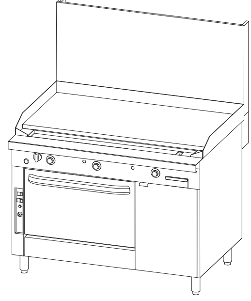
Model P48A-TTTT with optional 24" flue riser

** MANUAL GRIDDLES DO NOT ALLOW SPECIFIC TEMPERATURE OPERATION **