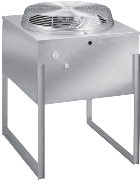
JCF900 Remote Condenser

Models JCF0500 JCF0500Q(Coated Coil) JCF0900 JCF0900Q(Coated Coil)