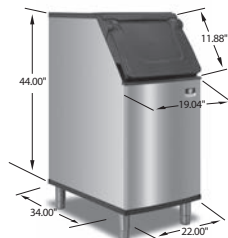
D420 383 lbs. (174 kgs)