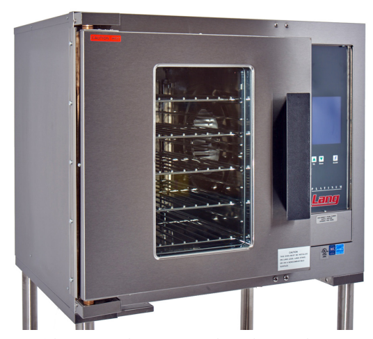
ECOH-PT SHOWN WITH OPTIONAL 16" STAND