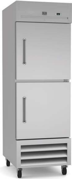
738280 (KCHRI27R2HDR) 2-half door reach-in refrigerator, stainless steel, 23 cubic feet, R290 refrigerant gas, +33/+41°F