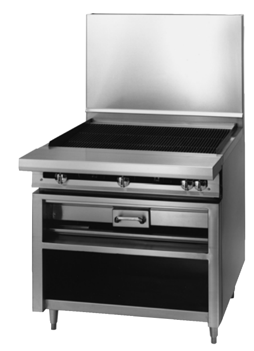
JTKC-36 shown with optional high riser