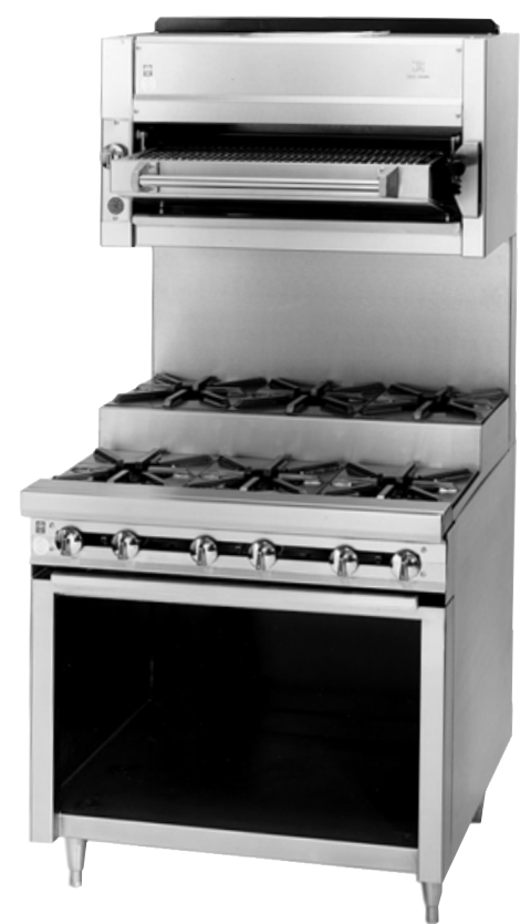
JSB-36RMT shown with JTRHE-3-3