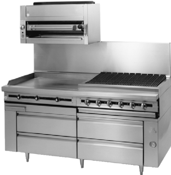
JMRH-36GT with range match broiler, remote refrigerator base, and range mount salamander