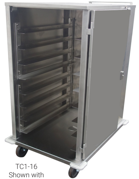
TC1-16 Shown with Optional Corner Bumpers