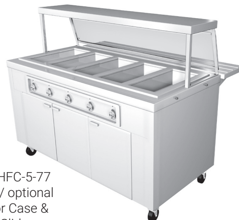
Model SHFC-5-77 Shown w/ optional Protector Case & Tray Slide