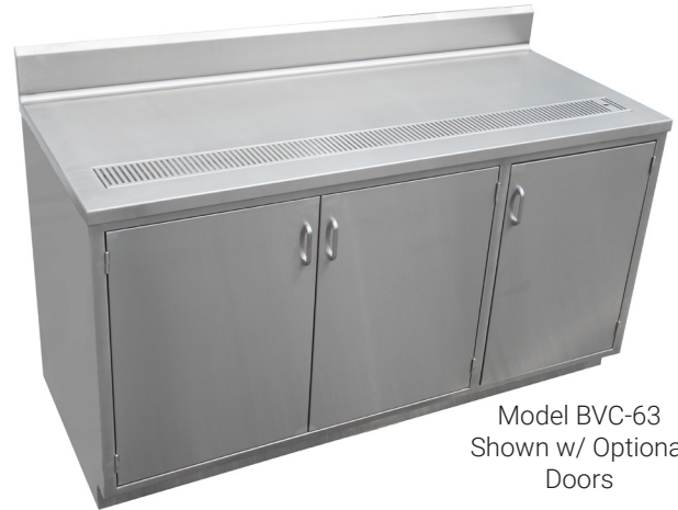
Model BVC-63 Shown w/ Optional Doors