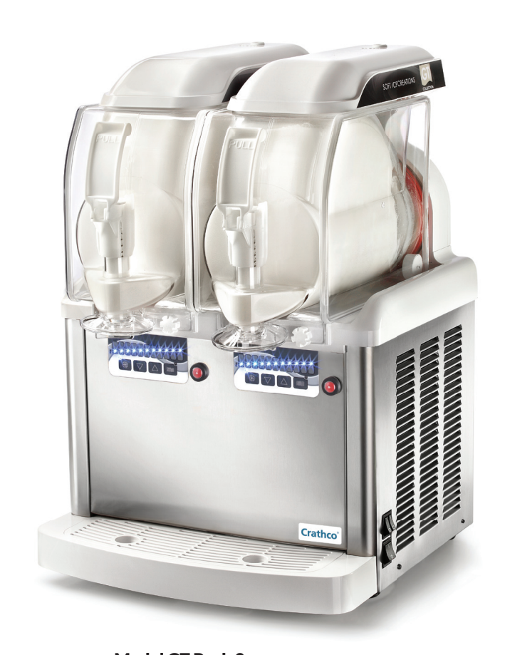
Model GT Push 2