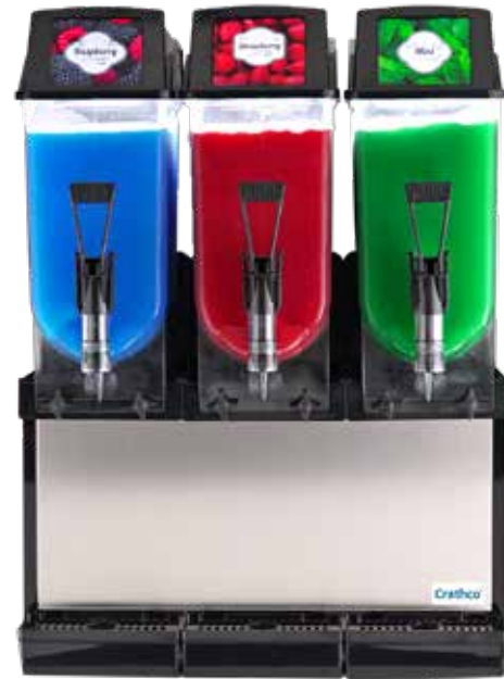
Model Frosty 3