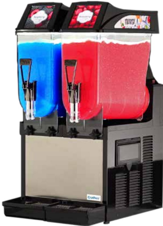
Model Frosty 2