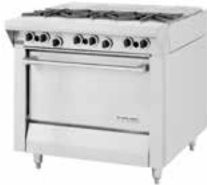
Model M43FTR French Top Range With 3 Open Burners & 3 Hot Tops