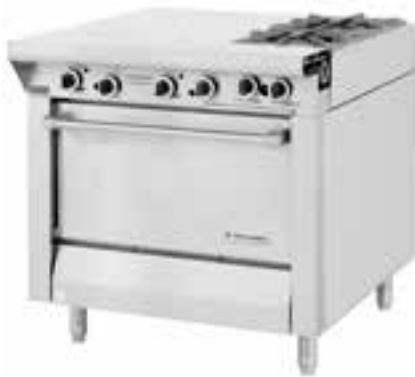
Model M43-2R Range With Even Heat Hot Top and Open Burners Combinations