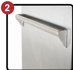
Rear Tubular Push Handle

Improve your operation today! See Specification page 07-02, RH-B series, for high volume basket rethermalization ovens from FWE.