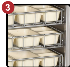
18" x 26" Baskets