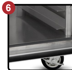
Open Bottom Base