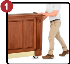
Made for Mobile Applications