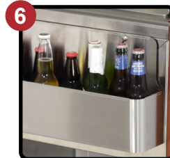
Removable Bottle Speed Rail