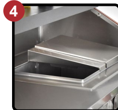
60lb Ice Bin with Drain