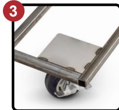
Tubular Welded Base Frame