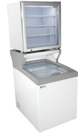
Combo MCT-2HC with 1 optional CTF-3HC