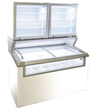
Double Combo-MCT-4HC with 2 optional CTF-3HC