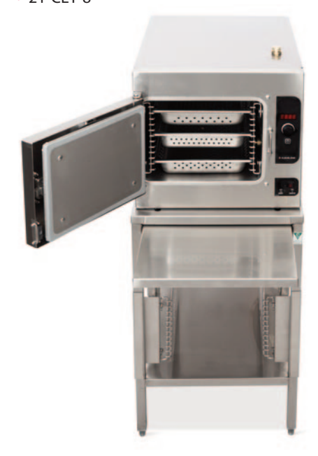
Shown with optional Stand and Cafeteria pans