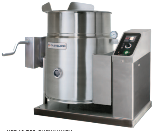
KGT-12-TGB (SHOWN WITH OPTIONAL EASYDIAL CONTROLS)