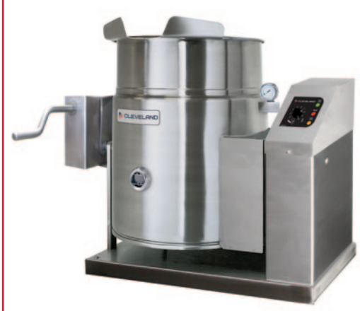
KGT-12-TGB (SHOWN WITH STANDARD CONTROLS)