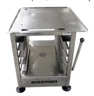
Mobile slicer stand with parking brake