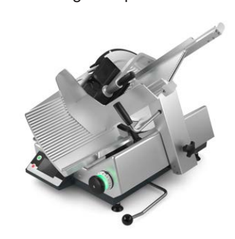
Touch display GSP H I W-90 with integrated portion scale