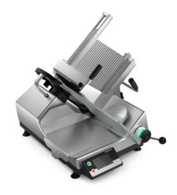
GSP H I W-90 with integrated portion scale