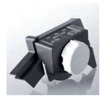
Remote sharpener, better food safety