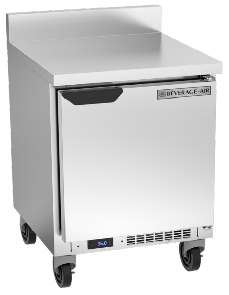
*Note: Shown with optional full electronic control

5 Year Parts/Labor Warranty Available 7 Year Compressor Warranty