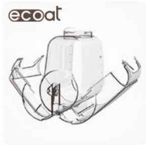
Energy Saving Less condensation system