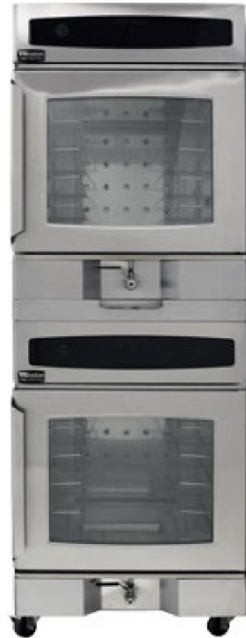
Model Shown: CHV7-05UV Stacked

The CVap CHV is essentially a Cook and Hold on steroids. It can do the traditional "low and slow" cooking...with more control and insane yields. It also has the versatility to bake, braise, poach or low-temp steam, and it can be used in sous vide mode for increased precision. We've got volumes of science and data to back us up, but only so much space here. So, if you want to learn more, go to our website, www.winstonfoodservice.com , and geek out with us.