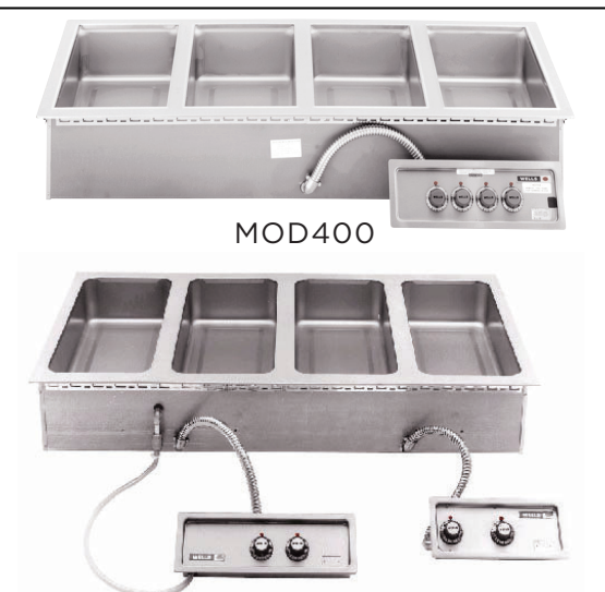
MOD400TDMAF with dual control panels