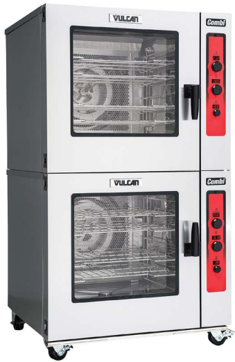
Model ABC7E Shown stacked