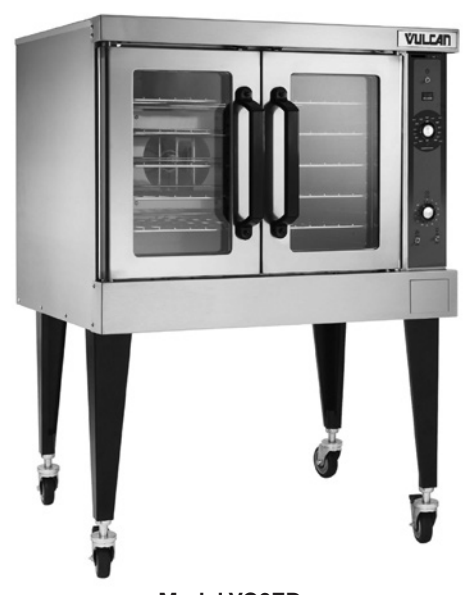
Model VC6ED Shown with optional casters