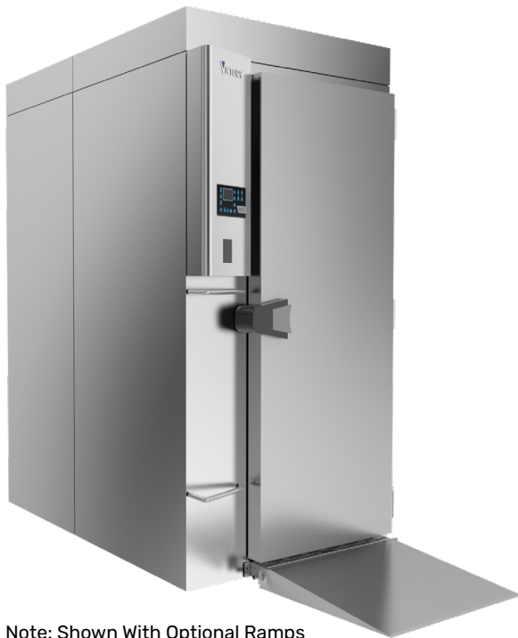
Note: Shown With Optional Ramps