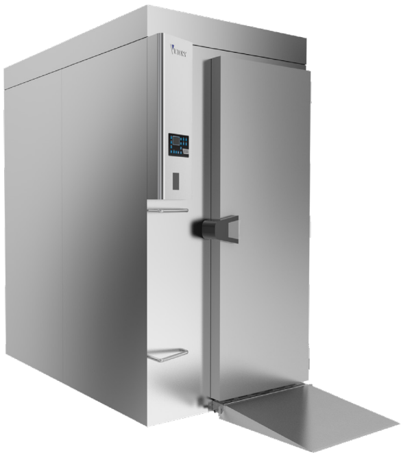
Note: Shown With Optional Ramps