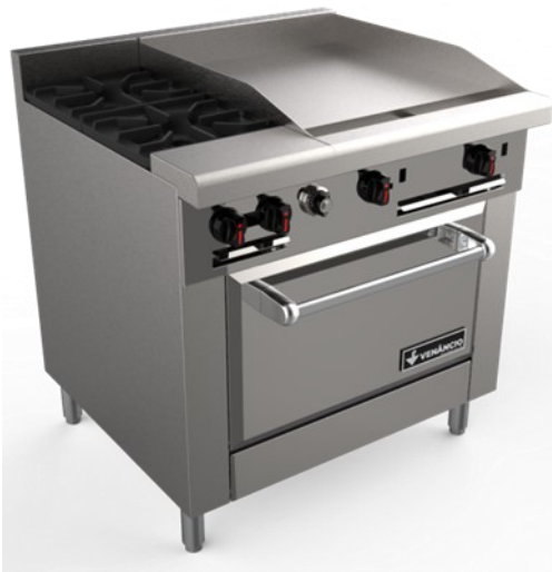
Model R36ST – 12B 24G

100% manufactured from raw materials providing the highest quality and durability